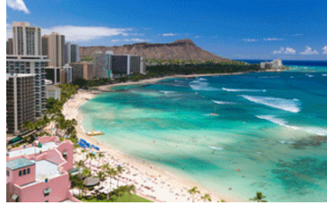
Hawaii ~ Paradise Found